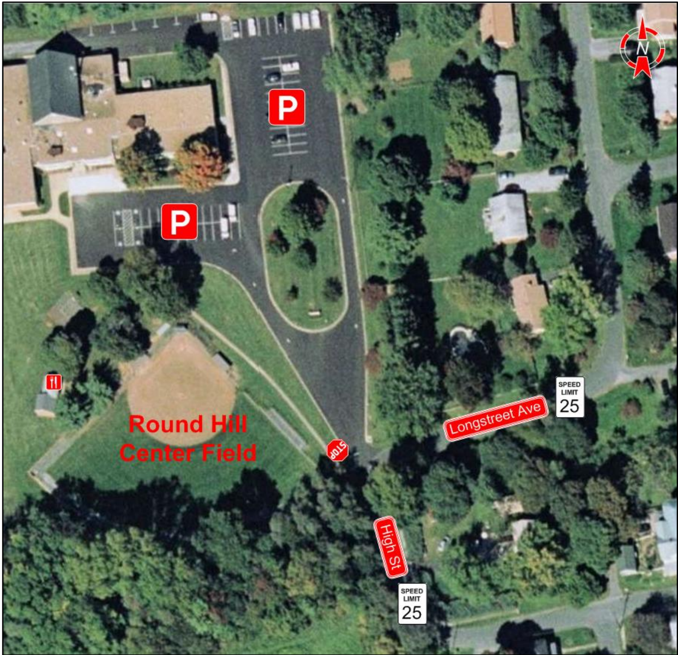
Figure 3 - Round Hill Center Field